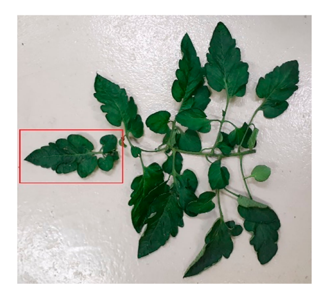
Figure 1. Whole tomato leaf, with terminal leaflet marked in red square.

large for the area meter, and it was decided that the terminal leaflet would represent the surface area well enough. All terminal leaflets were cut at the exact same point on each leaf.